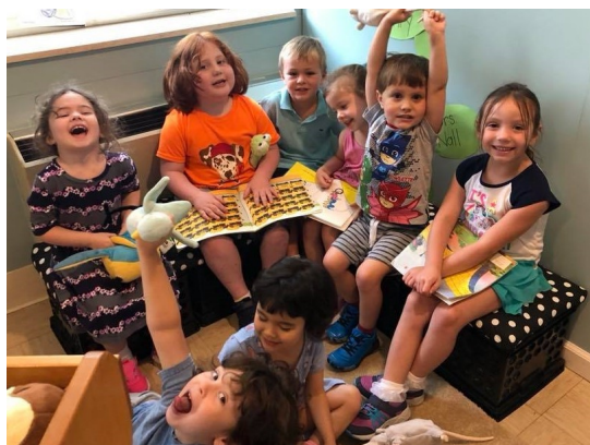
The pre-K class at TAI preschool enjoyed their time together in the reading corner.

The Preschool is very busy during the month of October. We will be having our class pictures taken by Holifield, and we will take our annual field trip to Bi-Water Farm in Georgetown. We will hope for good weather because the children and their families love spending the day together with their teachers exploring the Pumpkin Patch. October is always a fun month for the Preschool!