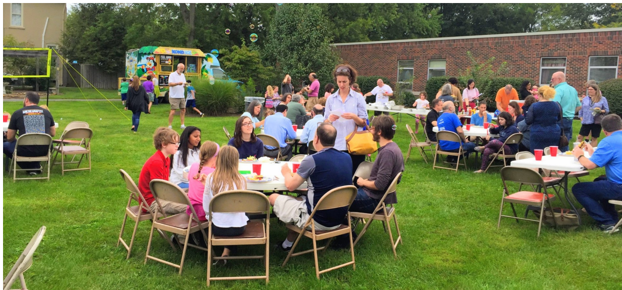
The weather cooperated on Sept. 16 for Brotherhood's annual picnic to mark the opening day of Religious School.