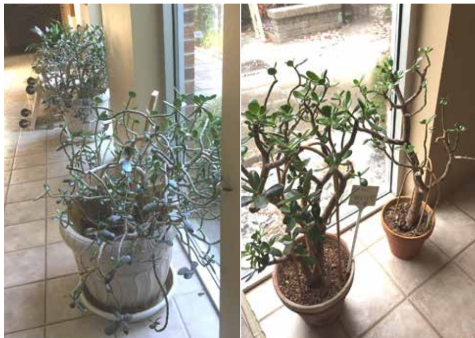
Left: The decades-old jade plants had become top-heavy and root-bound.