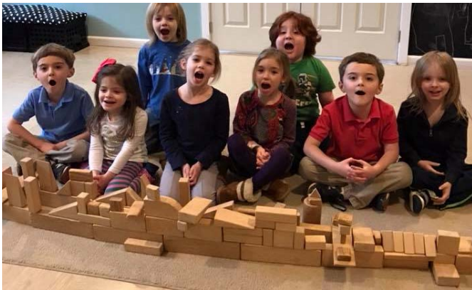
While learning about China in February, TAI Preschool's transitional kindergarten class built the Great Wall out of wooden blocks.

We will end the month learning about the Passover. This year, Passover occurs entirely during spring break, so we will spend the week before singing songs, reading stories and having a classroom Seder.