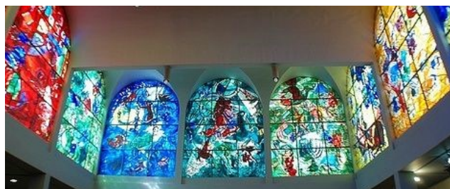
The Chagall windows in Jerusalem's Abbell Synagogue

Under Hadassah's Perpetual Yahrzeit Program, loved ones are remembered each year, in perpetuity, on the Hebrew date of death with a recitation of Kaddish in the Fannie and Maxwell Abbell Synagogue at Hadassah's hospital in Ein Kerem, Jerusalem. The synagogue is home to the famed stained glass windows by Marc Chagall that depict the deathbed blessings Jacob bestowed on each of his 12 sons, who became the founders of the 12 Tribes of Israel.