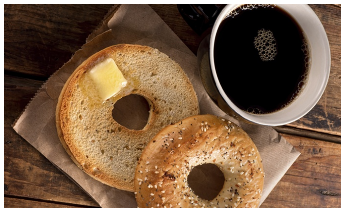
Sisterhood will provide bagels and coffee for the opening day of Religious School on Sunday, Sept. 16.

Be on the lookout for an invitation to our opening meeting, which will take place in mid- to late September. It's so nice to gather together with friends, chat about your summer adventures and get excited about the