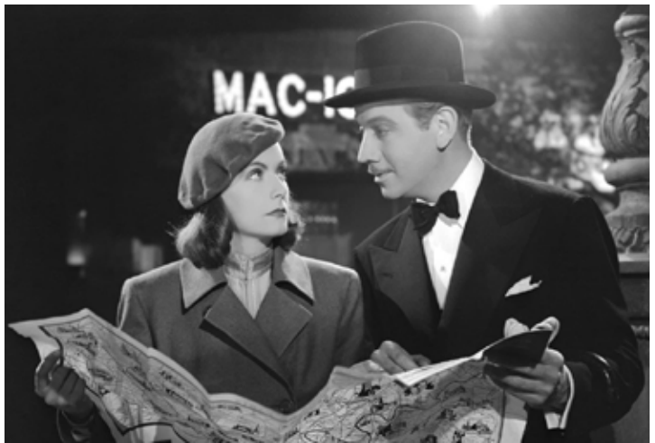
"Ninotchka," directed by Ernst Lubitsch, and starring Greta Garbo and Melvyn Douglas, kicks off the First Saturday (or Not) Film Series Nov. 9.

Two of the films we'll watch — "Ninotchka" (Nov. 9) and "The Women" (Feb. 1) — are among the host of terrific movies made in 1939. The third, "Confessions of a Nazi Spy" (Dec. 7), though not top of the heap, is considered a solid thriller and has historical importance as the first Hollywood picture to draw attention to the threat of Nazi Germany. Two of our directors are Jewish immigrants from Europe; the third was first generation from the Lower East Side.