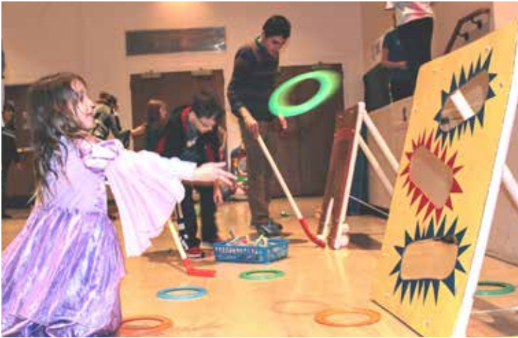
Purim Carnival right on target

Late February and early March was a busy time for Temple Adath Israel, before statewide COVID-19 precautions led to the shutdown of services and other activities.