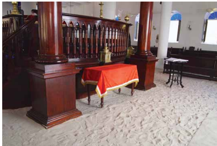
The sand-covered floor at Mikvé Israel-Emanuel in Curaçao