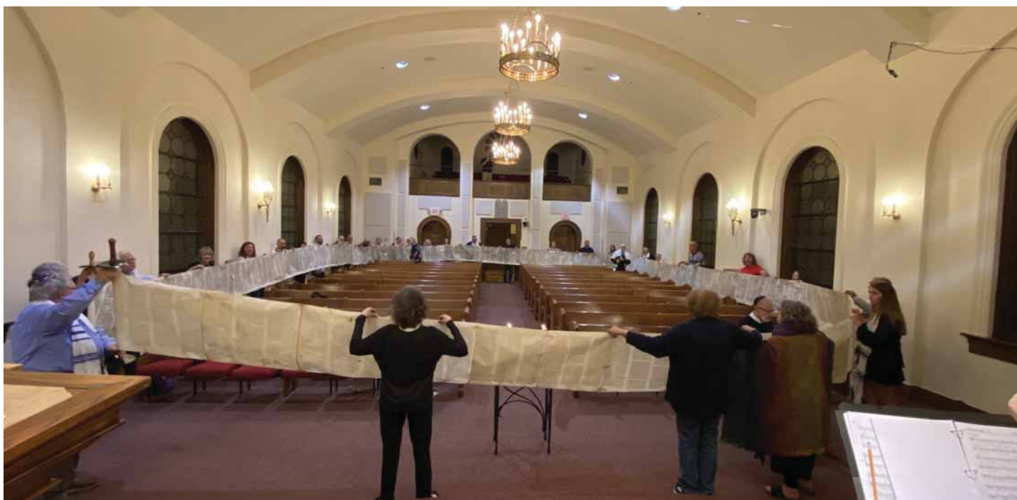
The Turnov Torah was unrolled after TAI’s two other Torahs were paraded around the sanctuary during the Simchat Torah service.

Hanukkah’s emphasis on light during the darkest time of year is a powerful metaphor for hope and resilience. The story of the miracle of the oil, which lasted eight days despite seeming insufficient, teaches about faith, perseverance and the belief in miracles even in challenging times. During a time when we see great anxiety, social and political division, spiritual questioning and unknowing of the future, let us remember the phrase repeated when we complete the reading of a book of the Torah, as we did during our Simchat Torah celebration, Chazak, chazak, v’nitchazeik. ” Be strong, be strong, and we will strengthen one another.”